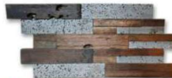
RW-1706 Ancient ship wood + lavarock (600mm x 300mm x 20mm)

Material: Various reclaimed wood Finish: Lacquered