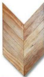
RW-18008 Reclaimed elm wood (345mm x 430mm x 10mm)