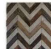
RW-1708 Ancient ship wood + effect paint (300mm x 300mm x 15mm)