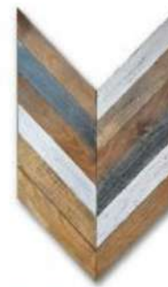
RW-18009 Reclaimed elm wood + effect paint (345mm x 430mm x 10mm)