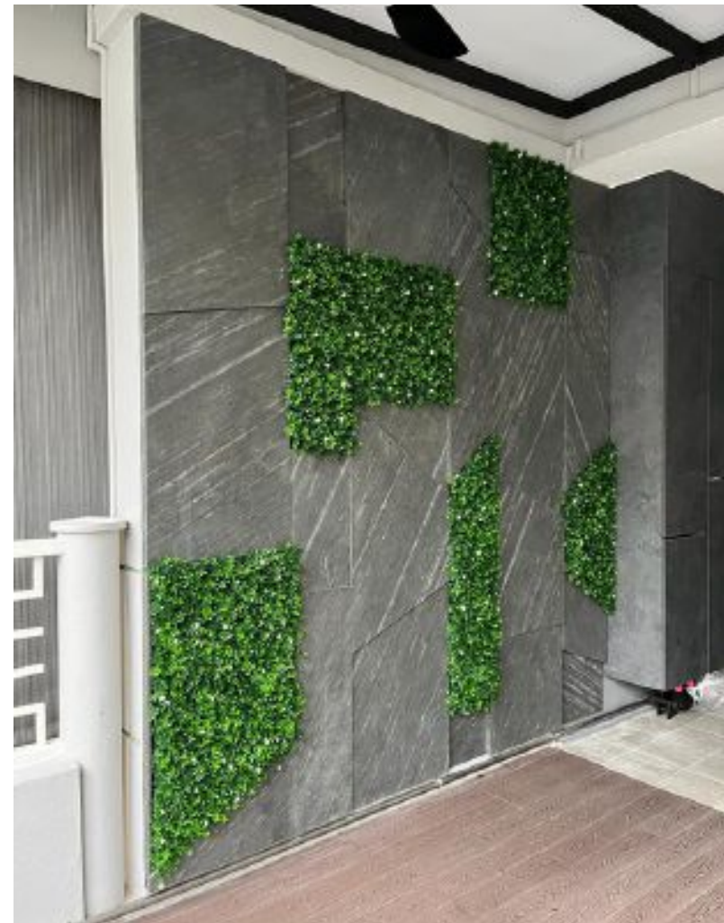
Semi Outdoor Wall